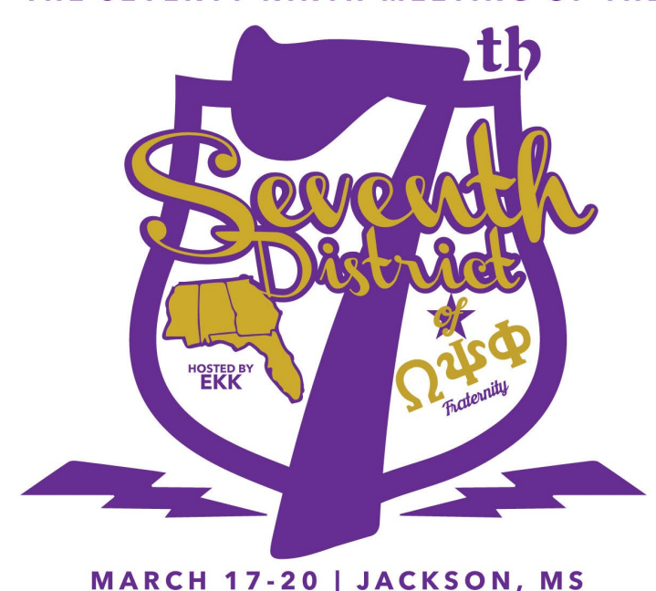
MARCH 17-20 | JACKSON, MS HOSTED BY EPSILON KAPPA KAPPA CHAPTER